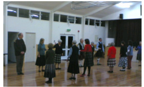
Dancing at Innes Club

The month finished with me dropping in on my home club Innes, setting up the Summer School display and giving the short talk that I am well practiced at.