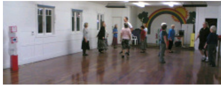
Dancing at Braemar Club